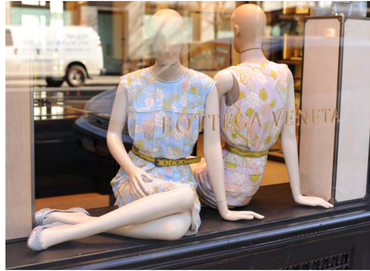
Bottega Veneta is coming to 740 Madison.