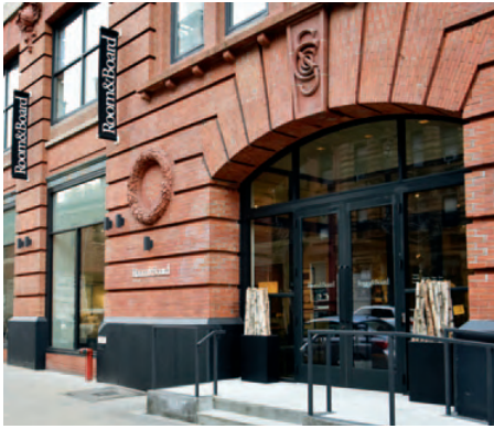
Room&Board is open in Chelsea.