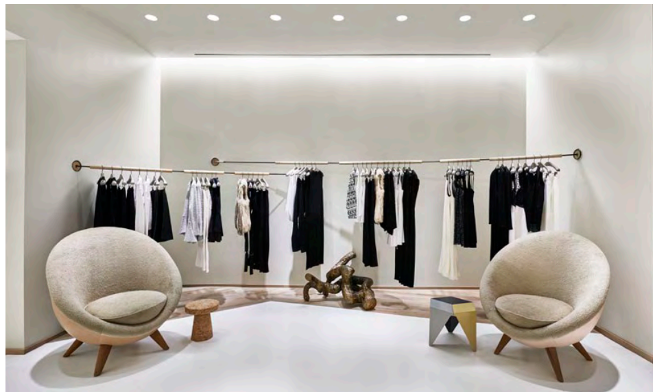
Derek Lam 10 Crosby in SoHo.