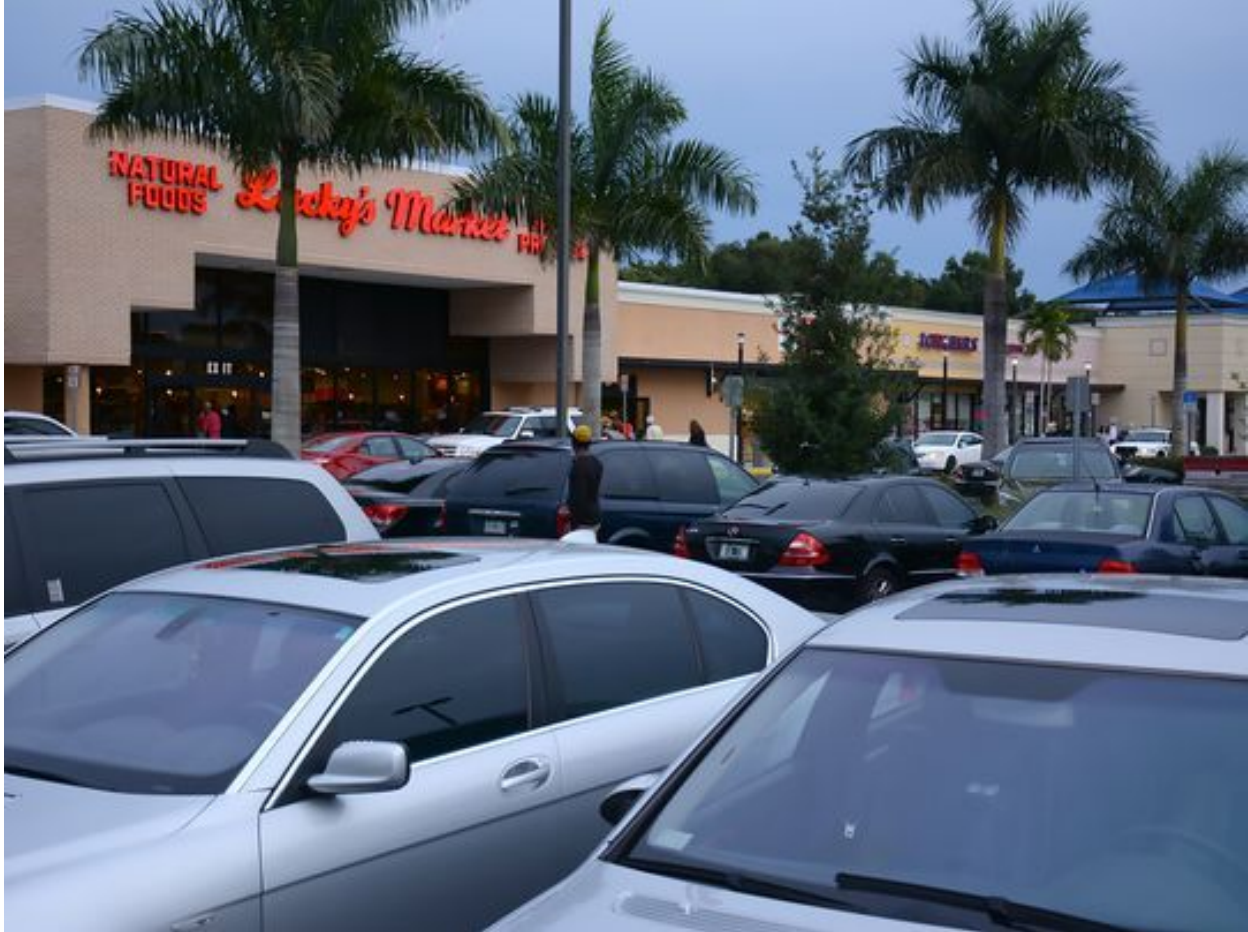
Lucky's Market in the Naples Town Center draws a crowd for its grand opening. The East Naples corridor is experiencing a boom in retail construction and redevelopment.