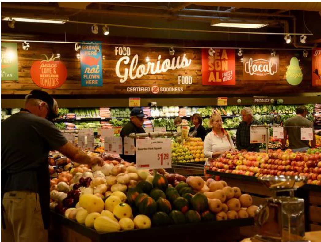
Lucky's Market opened in January 2016 on U.S. 41 East in East Naples. The grocery chain plans to open two locations in North Naples.

Lucky's, which has 28 locations across the country, expects its total store count to grow to more than 40 by the end of the year.