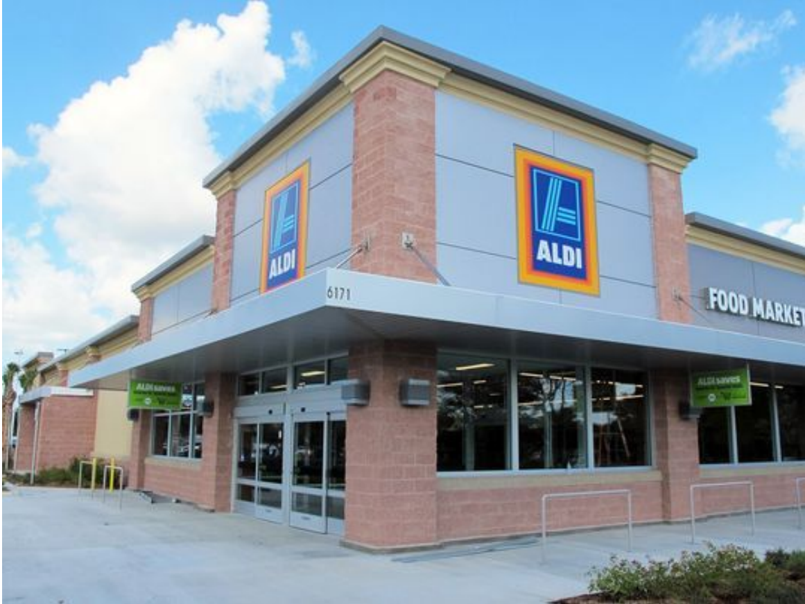
After opening its first area grocery store on Naples Boulevard in North Naples in November 2016, Aldi plans its second and third locations in East Naples.

None of the stores on the chopping block are in Collier County. One Winn-Dixie — at the Mission Hills shopping center near the corner of Vanderbilt Beach Road and Collier Boulevard — is temporarily closed and under repair after serious damage from Hurricane Irma.