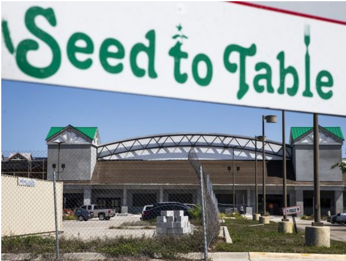
The Oakes Farms Seed to Table grocery store, as seen on Thursday, April 12, 2018, is targeted to open its North Naples location in late 2018.

While more shopping has moved online, including grocery shopping, customers still like to pick out their own fruits, vegetable and meats — and some food can't be purchased on the internet, giving consumers good reason to go to the supermarket.